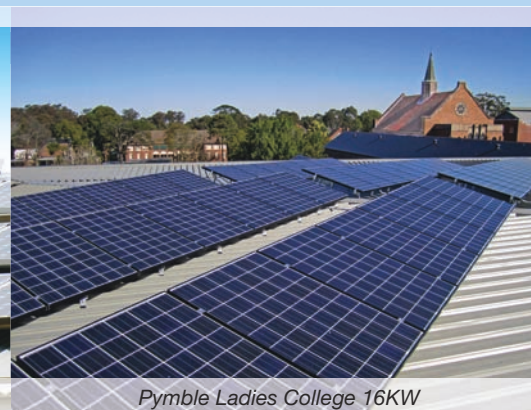
Pymble Ladies College 16KW