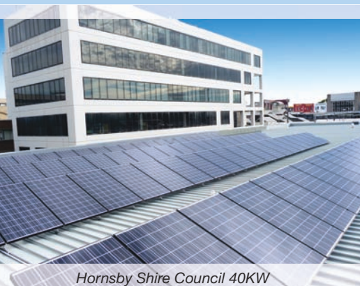
Hornsby Shire Council 40KW