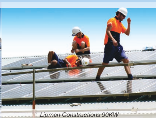
Lipman Constructions 90KW