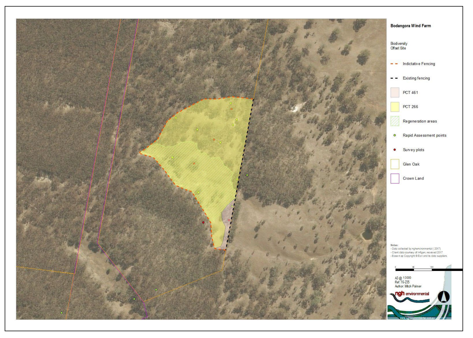
Figure 7-2 – Location of offset area