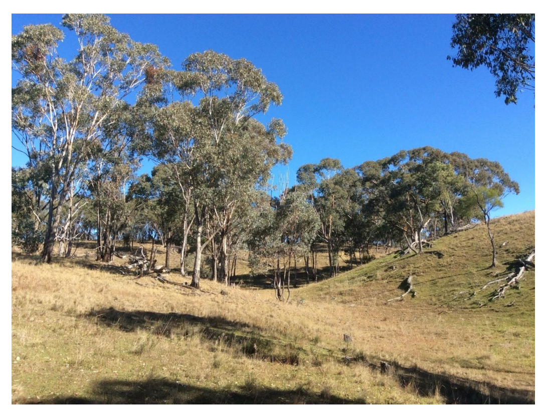
Plate 1 – PCT 266 White box woodland with a high diversity of native groundcover and regeneration