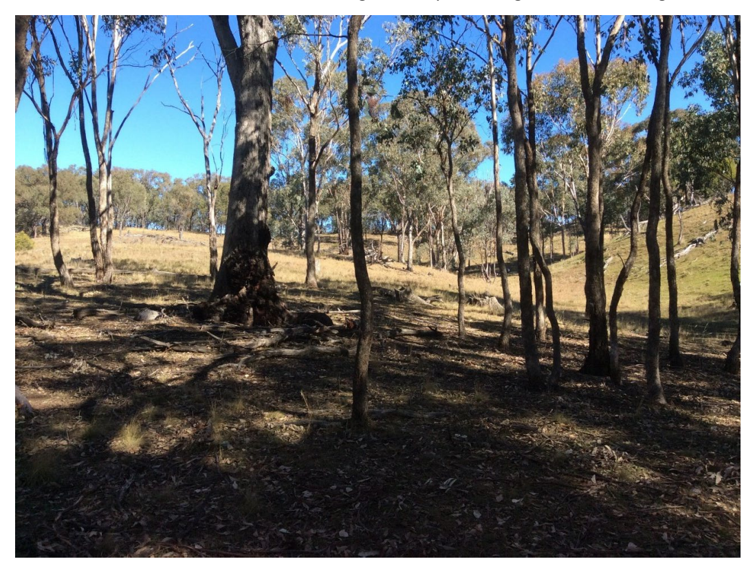
Plate 2 – PCT 266 White box woodland with a high diversity of native groundcover and regeneration