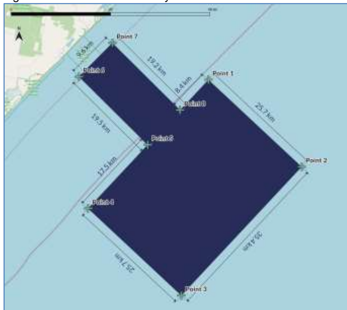
Figure 1: Points 6 and 7 survey area within 3NM